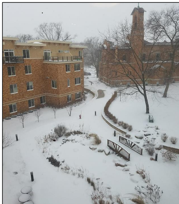
Our Winter Wonderland!