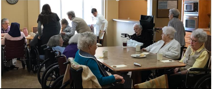
Wednesday mornings after Mass – coffee, goodies, and conversation in the Care Center.