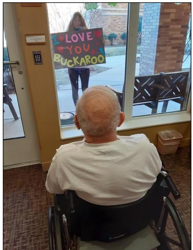
From our Care Center: there's always a way to say "I love you."

2:00-2:30 – Fit Sit (exercising while seated)