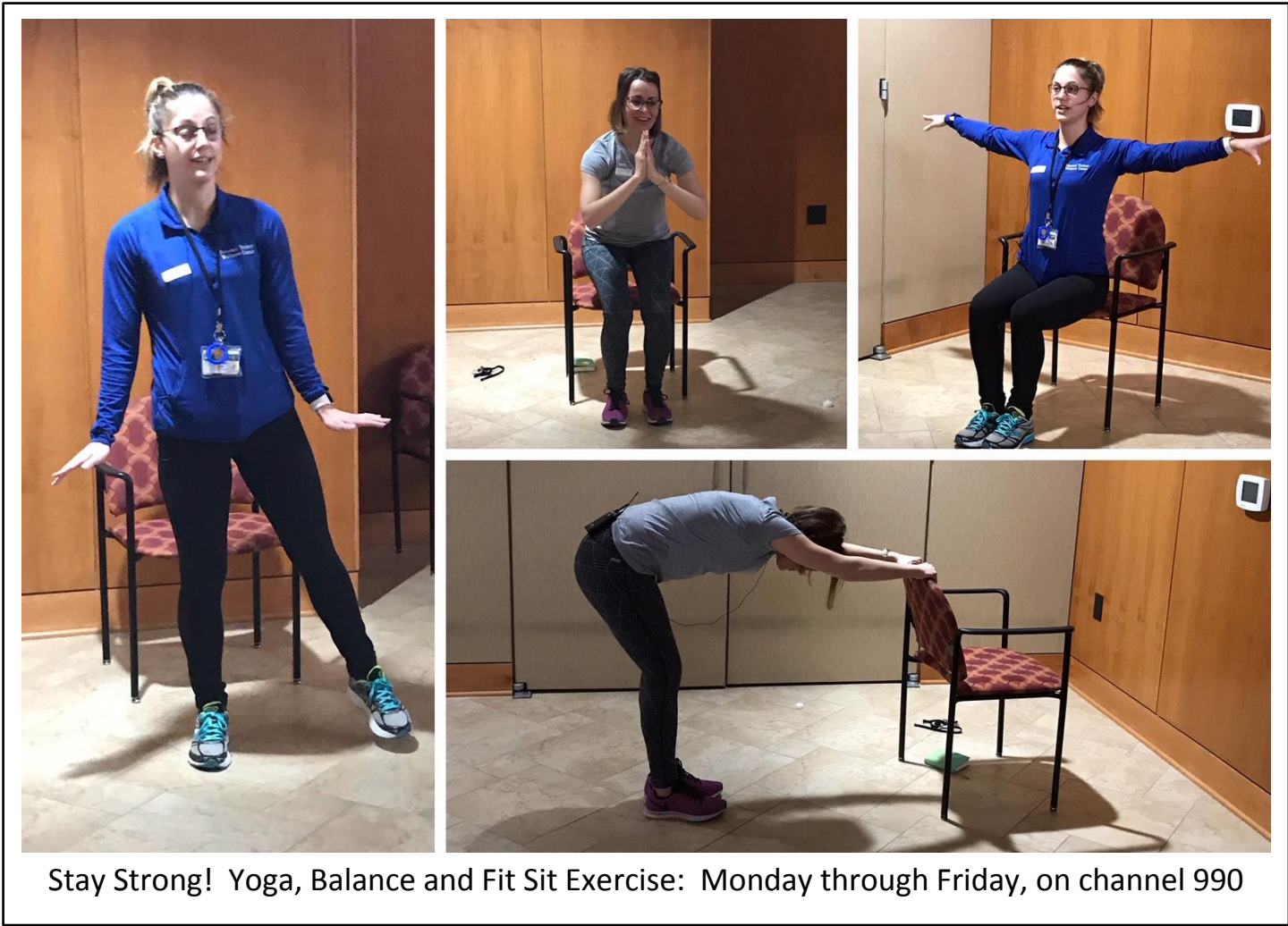
Stay Strong! Yoga, Balance and Fit Sit Exercise: Monday through Friday, on channel 990