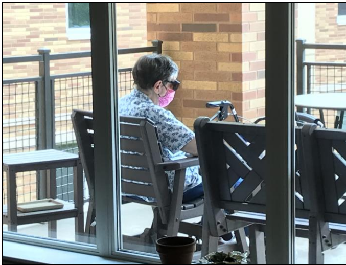
Enjoying the balcony