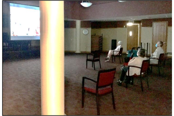
Afternoon at the Movie