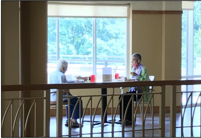
Lunch in the Bistro