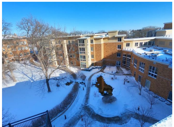
Carondelet Village in the fall and the winter.